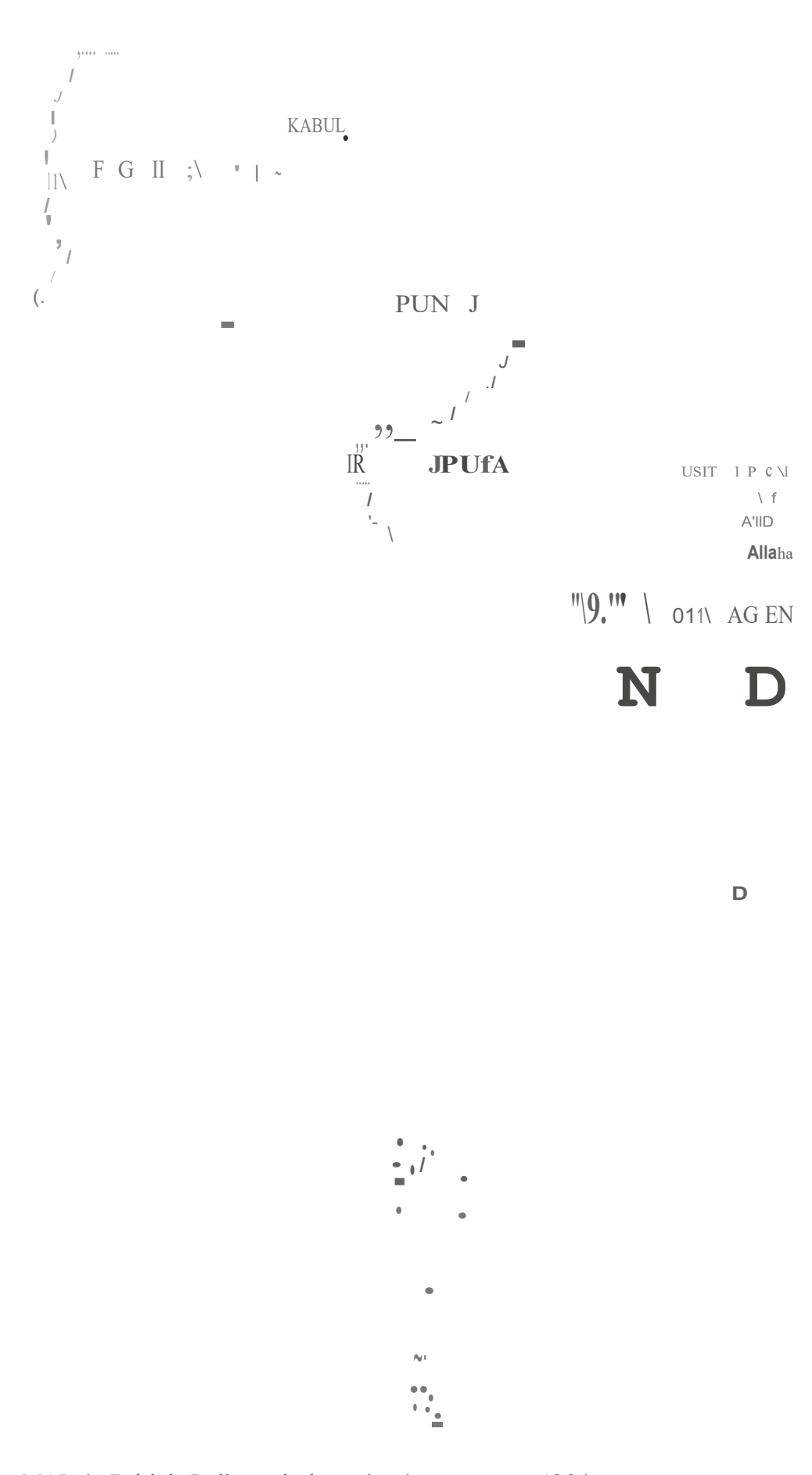
MAP 4: Briri h India and the princely tare , c. 1904